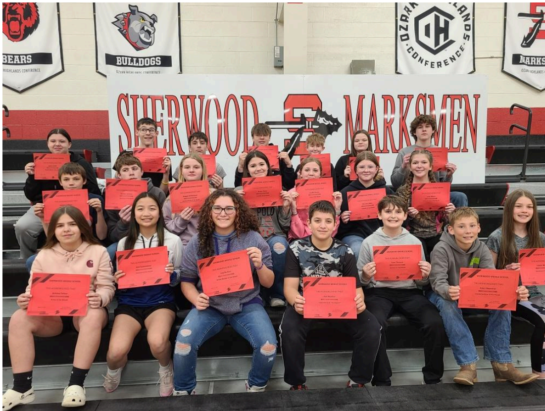
Students of the Month