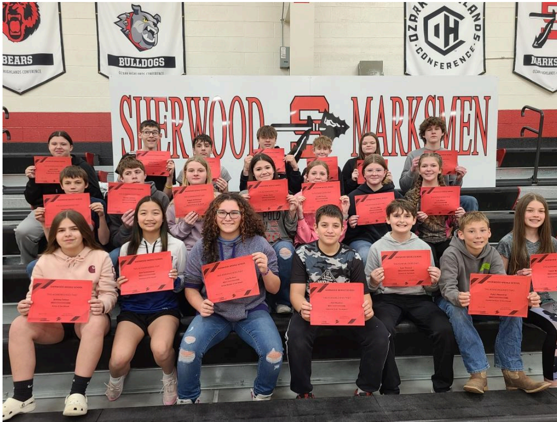
Students of the Month